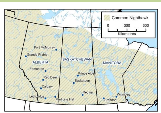
Range of Common Nighthawk in Prairie Provinces