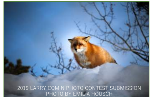
2019 LARRY COMIN PHOTO CONTEST SUBMISSION