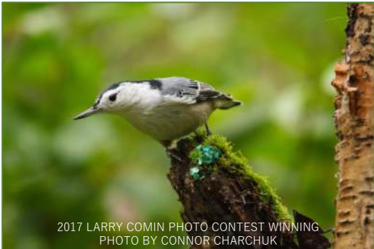
2017 LARRY COMIN PHOTO CONTEST WINNING PHOTO BY CONNOR CHARCHUK

1015 – 1030 COFFEE BREAK (Provided in Banquet Hallway)