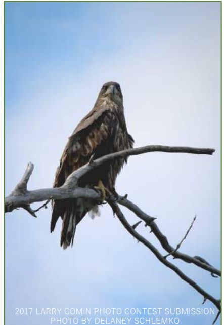
2017 LARRY COMIN PHOTO CONTEST SUBMISSION