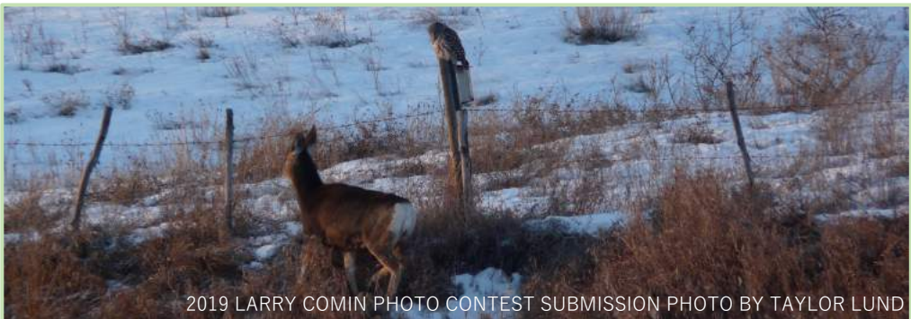
2019 LARRY COMIN PHOTO CONTEST SUBMISSION

In addition to these committees, we want to extend our gratitude to all volunteers who helped make this conference possible!