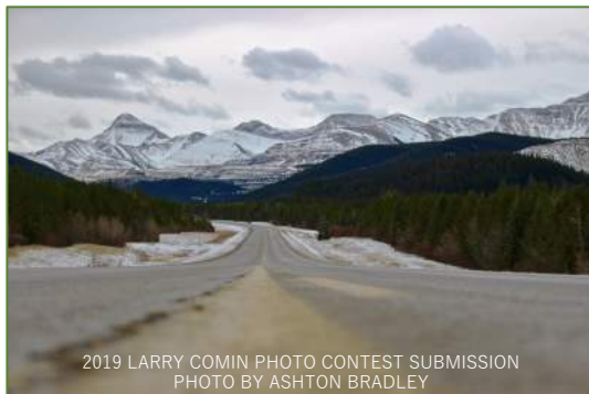
2019 LARRY COMIN PHOTO CONTEST SUBMISSION