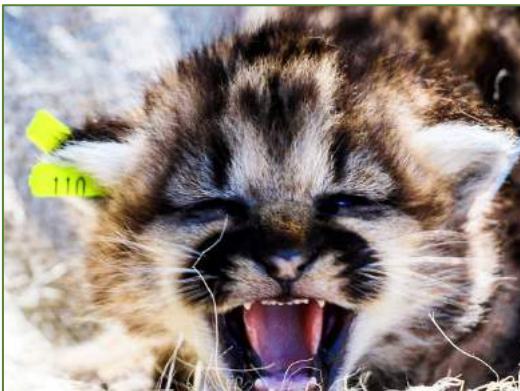
2019 LARRY COMIN PHOTO CONTEST SUBMISSION

1200 – 1300 LUNCH BREAK (Provided in Salon B/C)