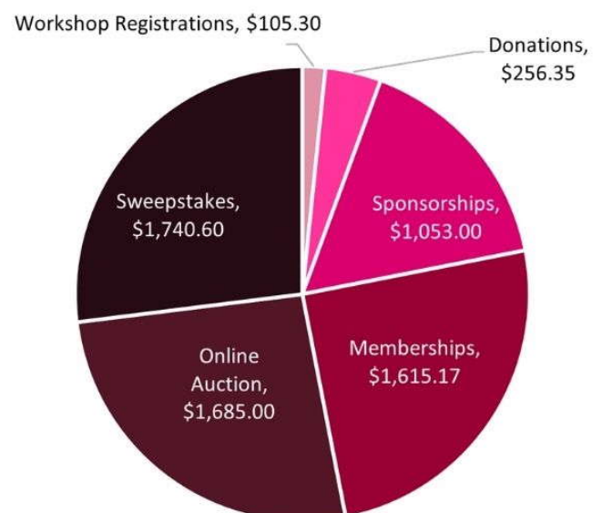
Fundraising Successes 2020* in addition to annual conference

Even though our 2020 conference was cancelled, our members and supporters demonstrated their support for the ACTWS by choosing to donate their registration or sponsorship costs. These funds were directed towards offering our 2020 conference online throughout the year.